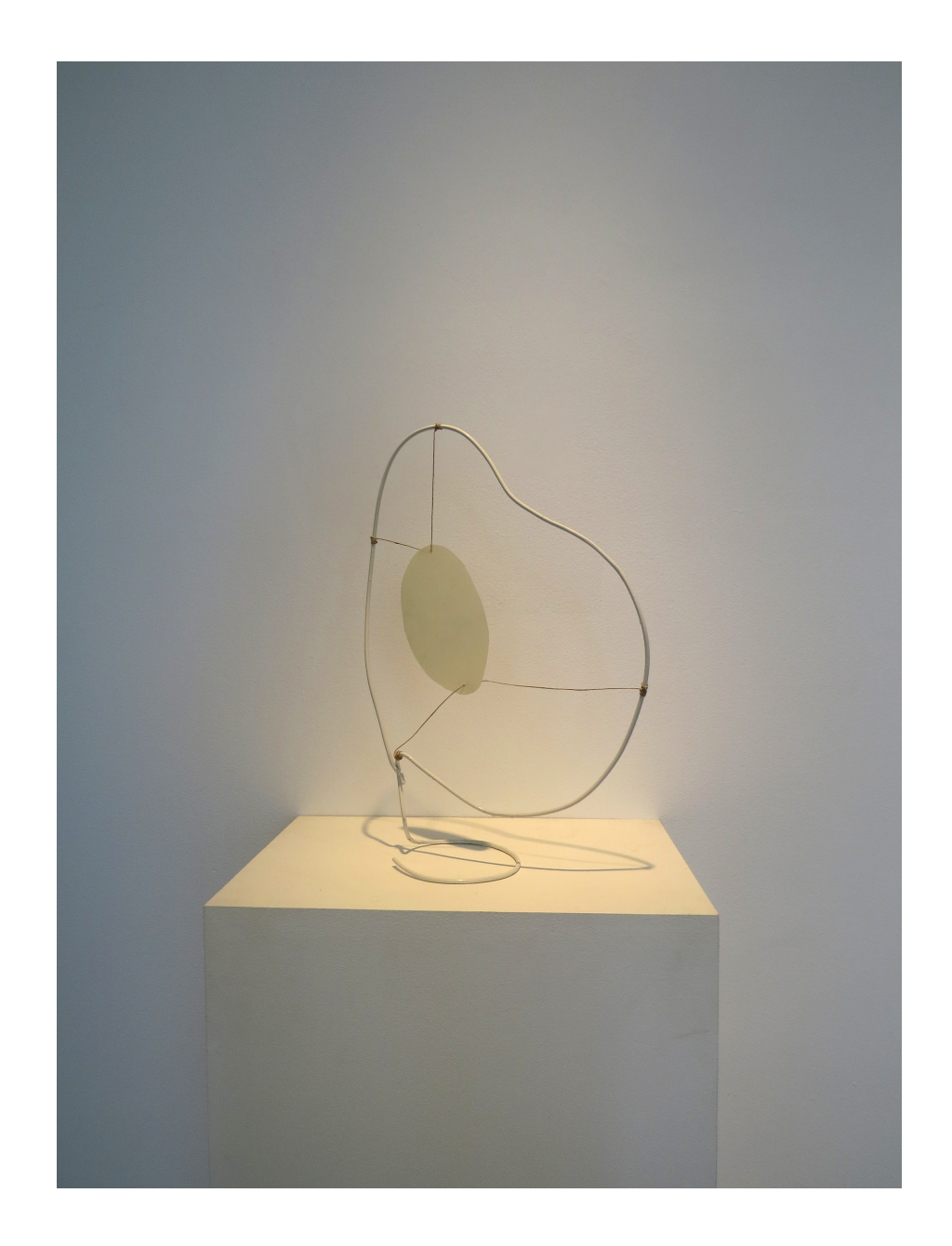
"Seed", 2016, Painted metal wire, twine, wax on paper 3 \times 20 inches