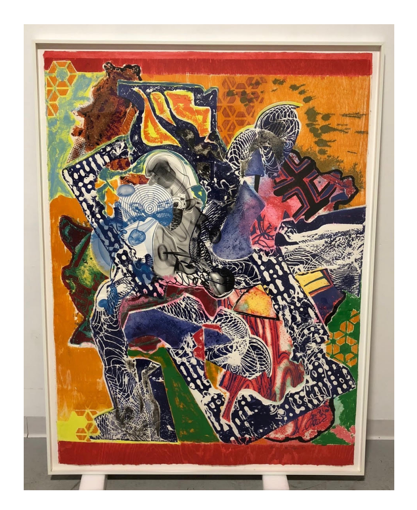
"Ain Ghazal Variation", Hand-colored monoprint, 1999, 65 x 49.5 inches

Anders Wahlstedt Fine Art recently sold "Ain Ghazal Variation" by Frank Stella to a prominent American West Coast collector. All of the prints in this series of thirteen are unique as the artist hand-colored certain areas with acrylic paint after printing. The monoprints are produced by an assemblage of metal and auxiliary plates which were set in the plywood base from which it was printed. This particular print is the Artist proof.