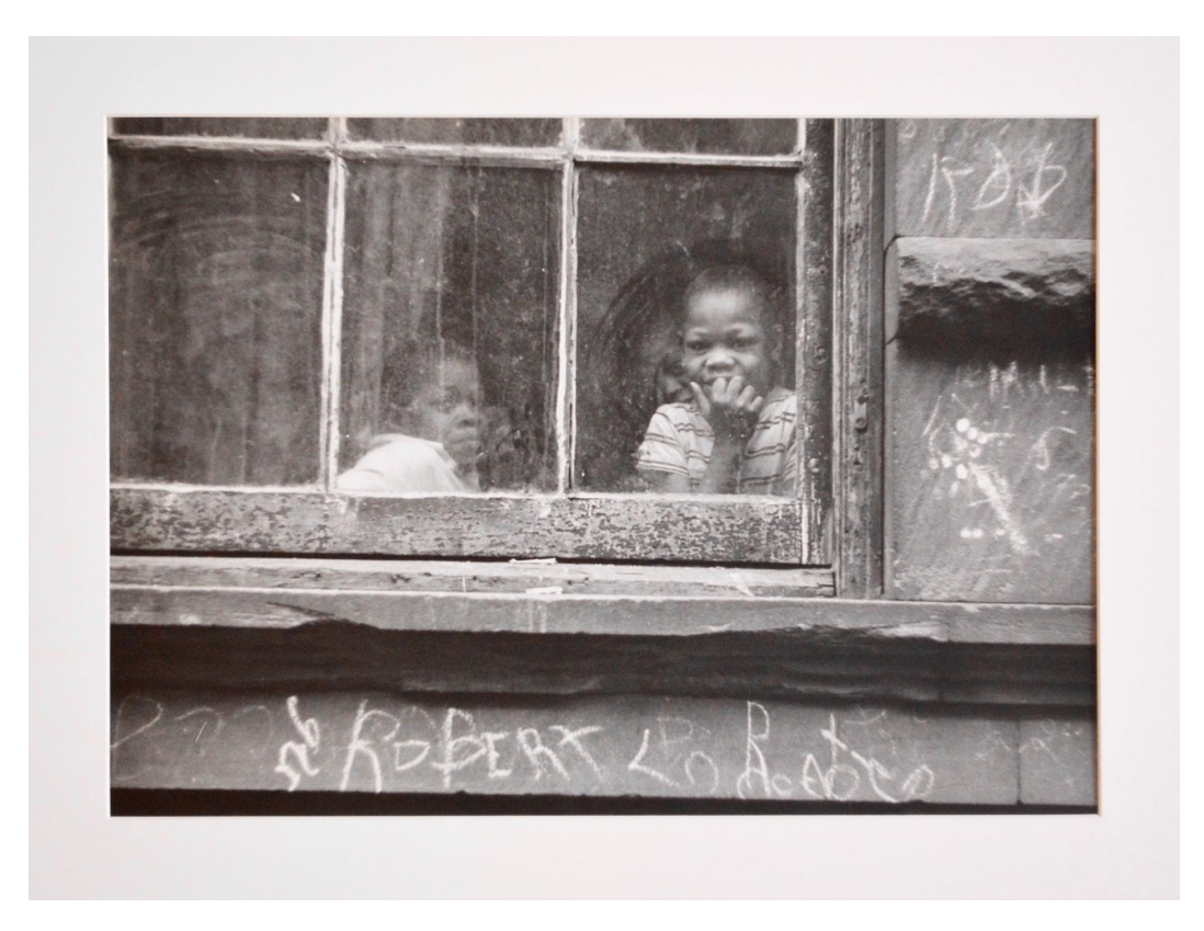
Roy DeCarava, Graduation, 1949, Estate of Roy DeCarava

Anders Wahlstedt Fine Art have a group of vintage prints for sale by Roy DeCarava. They were taken in the 1950's and all were printed no later than 1960. These all come from the collection of Harry Belafonte. These photographs are unusually large in format, measuring 14 by 19 inches and slightly larger. Vintage prints by Roy DeCarava are very scarce and hard to come by.