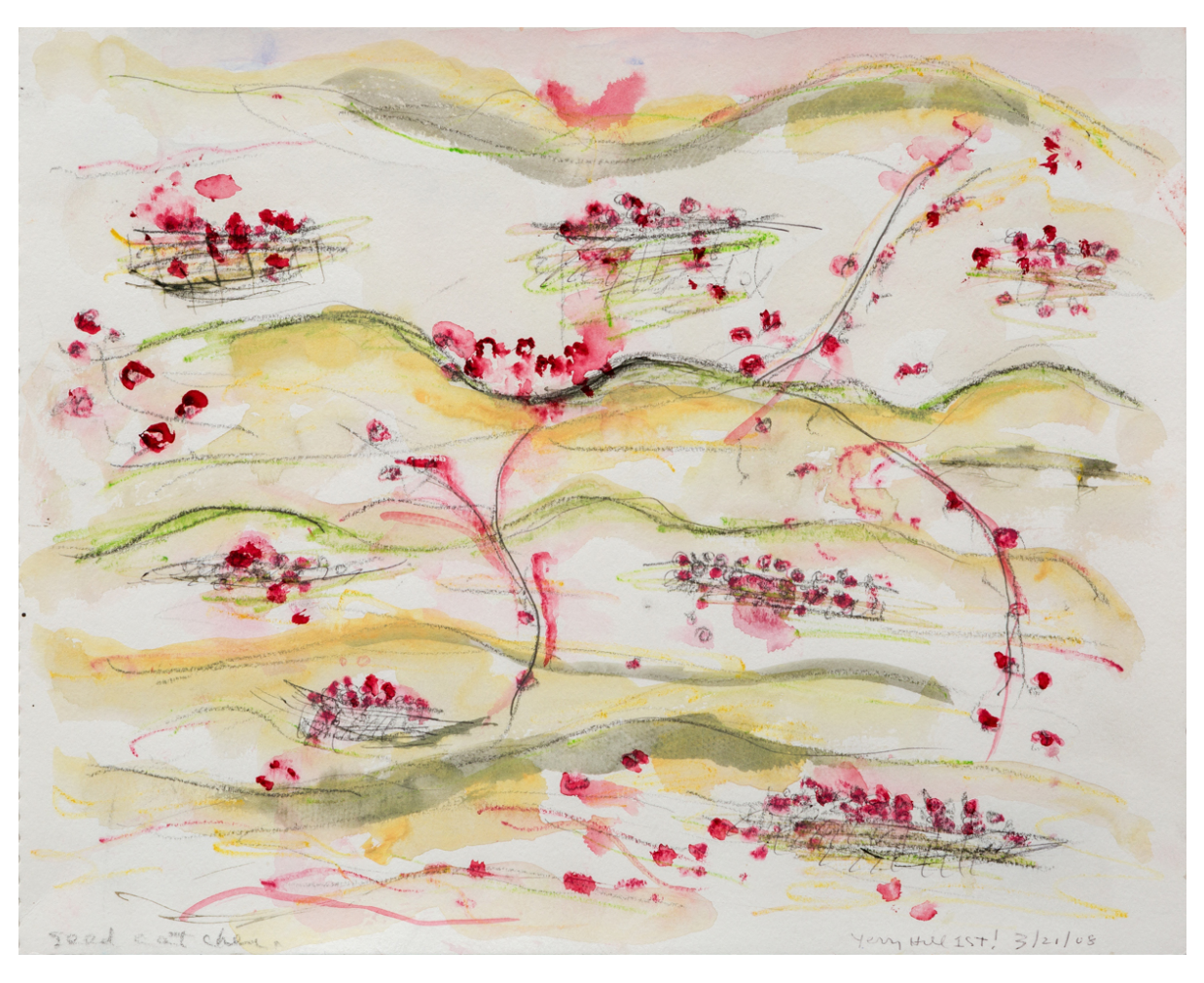
"Yerry Hill", 2008, Pencil and watercolor on paper, 11 x 13 inches